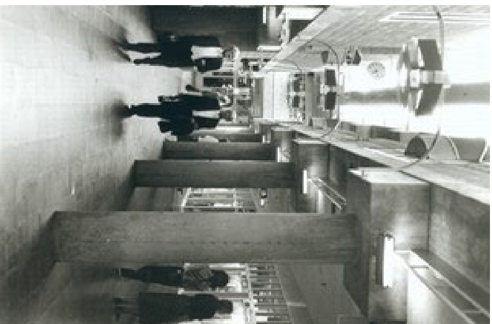
Interior view of the Vredenburg Music Centre, in Utrecht, NL (1976-78)

Hertzberger has designed some of the most (in)famous buildings in the Netherlands including the Vredenburg Music Centre in Utrecht (1976-78), the Bijlmer (plane crash) monument, the 'Diagon Housing' project and recently the Dutch Pavilion at the Venice Architecture Biennial in 2002.